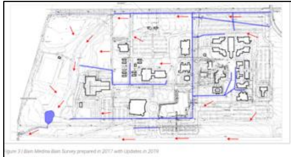
Figure 2.1 Basin Modeling Basin Survey prepared in 2017 with Updates in 2019